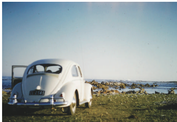
See you at the beach...

Holistic Care & Bespoke Therapy Dementia Recreational Program Respite Care Day Care Praise & Worship Memory Café Dementia Training & Workshops Dementia Care Consulting AD-Venture Sensory Therapy 24-Hour Nursing Reminiscence Therapy