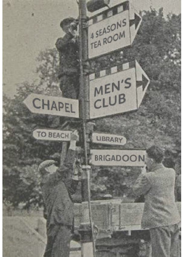
Our vision for the "Old Town".