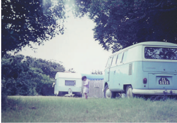
Camping on the grounds of Brigadoon Village Betty's Bay, 1967.

A classic, period dated Old Town consisting of a library, museum, milk bar, men's club, beauty salon, church, etc, recreated on a WWII Heritage Site.