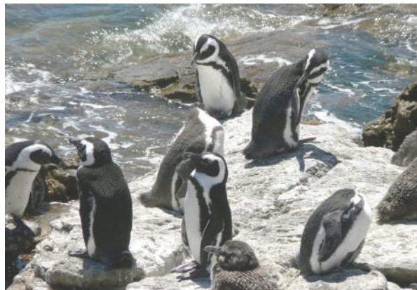
Penguins at the nearby penguin sanctuary.