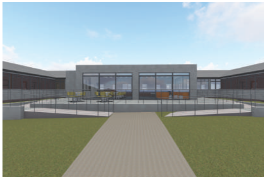
Architect's renderings of planned village in Betty's Bay.

14 single story two-bedroom apartments and communal sun room / dining room / lounge.