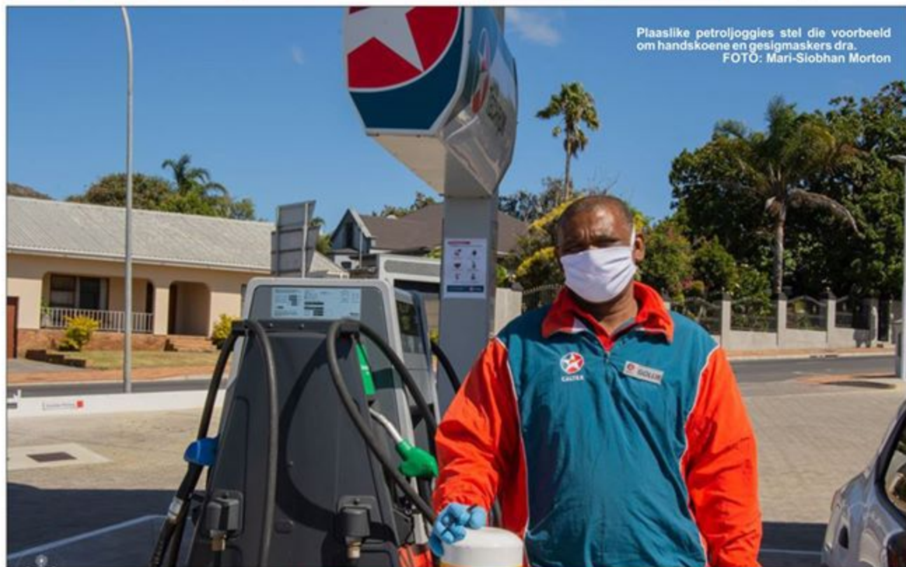
Plaaslike petroljoggies stel die voorbeeld om handskoene en gesigmaskers dra.

Pavilion Sentrum, Langstraat, Bredasdorp, P.O. Box 597, Sanlamhof, 7532 Tel: (028) 424 1986 Fax: (028) 424 1048