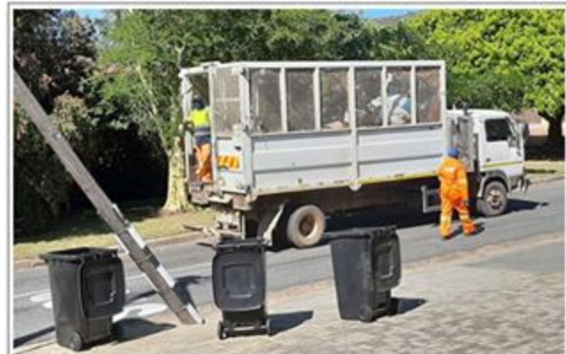
Kaap Agulhas se vullisverwydering het soos gewoonlik voortgegaan. Maandag vroeg was die onderskeie spanne reeds op hul pos.