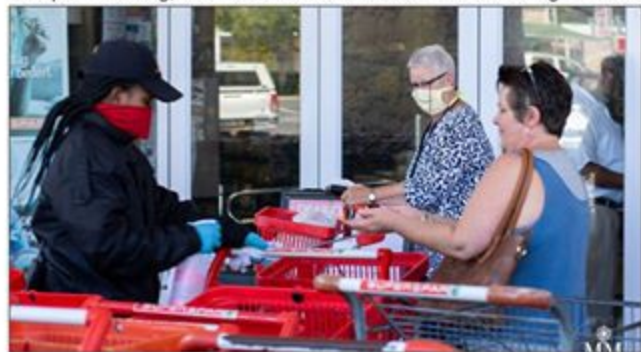
Handreiniging voor jy die winkel betree.