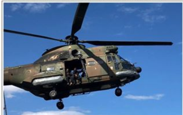
This photo was taken by Adri Claassen at Malgas on Tuesday. Everyone on board seen with face masks.

Alle advertensies kan soos normaalweg ingestuur word na suidernuusads@isat.co.za of skakel 028 424 1205 kantoor-ure.