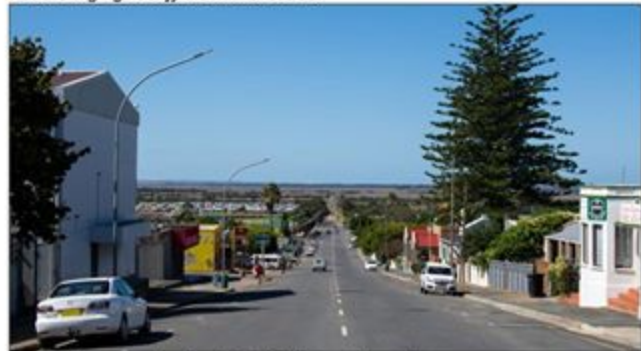
Bredasdorp se andersins besige Kerkstraat, is verlate.