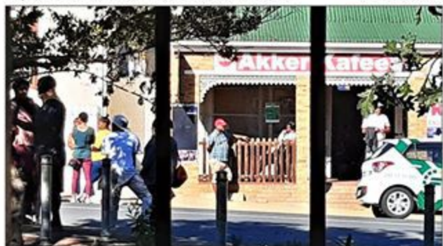
Op dag een het inwoners van Napier soos gewoonlik rustig hulle gang gegaan. Op dag 5 het taxibestuurders reeds self die getal passasiers begin monitor en toegesien dat hulle hulle hande ontsmet en nie styf teen mekaar sit nie. Tog is daar nog talle onsekerhede ...